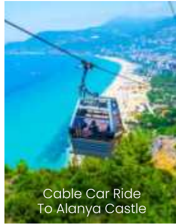
Cable Car Ride To Alanya Castle