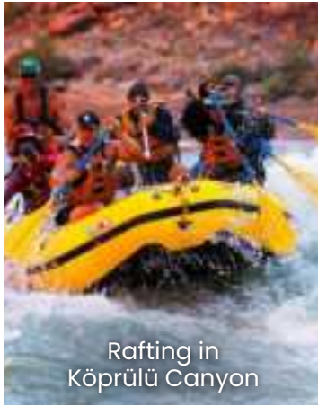
Rafting in Köprülü Canyon