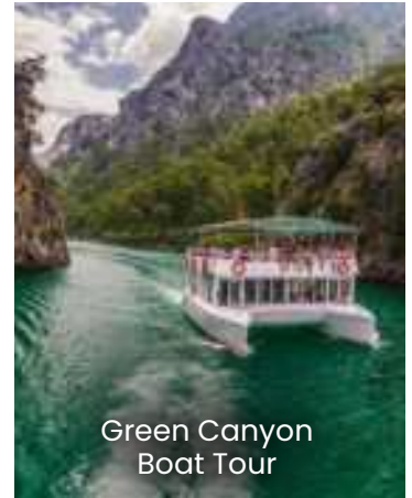
Green Canyon Boat Tour