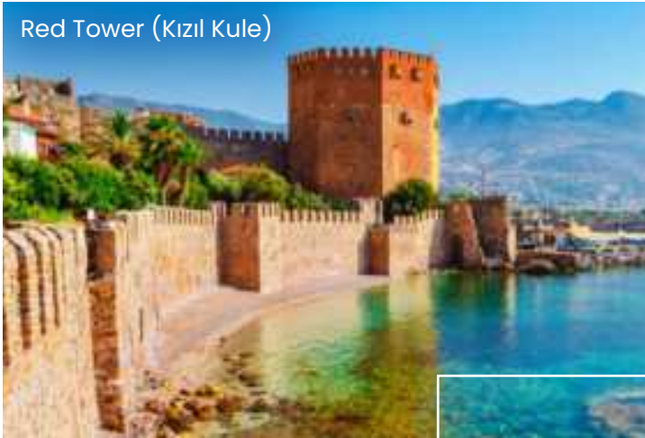
Red Tower (Kızıl Kule)