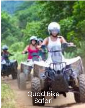
Quad Bike Safari